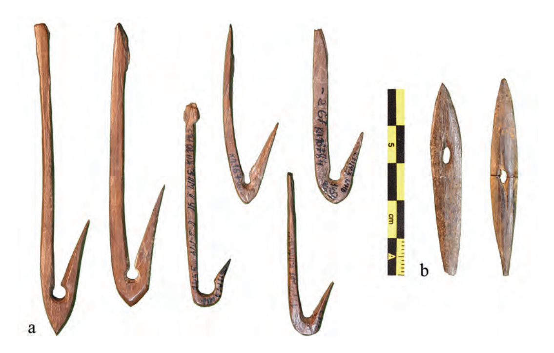
Figure 7. Zamostje 2. Fish hooks: a - Early Neolithic layer; b - Upper Mesolithic layer.

The fish processing tools can be seen to include a large number of knives made of elk ribs in the bone inventory. The use-wear analysis of 64 items from the Upper Mesolithic layer showed traces on several large tools (15 items), which could be interpreted as fish scaling (Clemente Conte & Girya 2003). This indicates fish treatment in the process of cooking (or for storage).