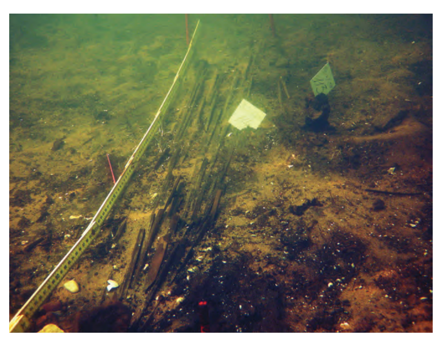
Figure 5. Zamostje 2. Fish screen in the Dubna riverbed, in the Upper Mesolithic layer. Seen from the north-east.