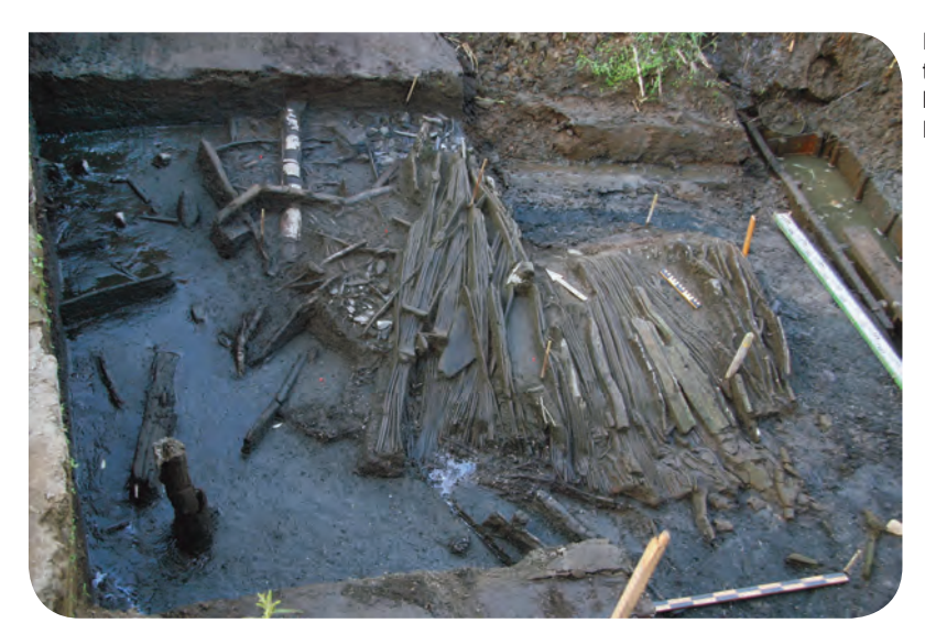
Figure 2. Zamostje 2. Fish traps in the Early Neolithic layer, seen from the south.