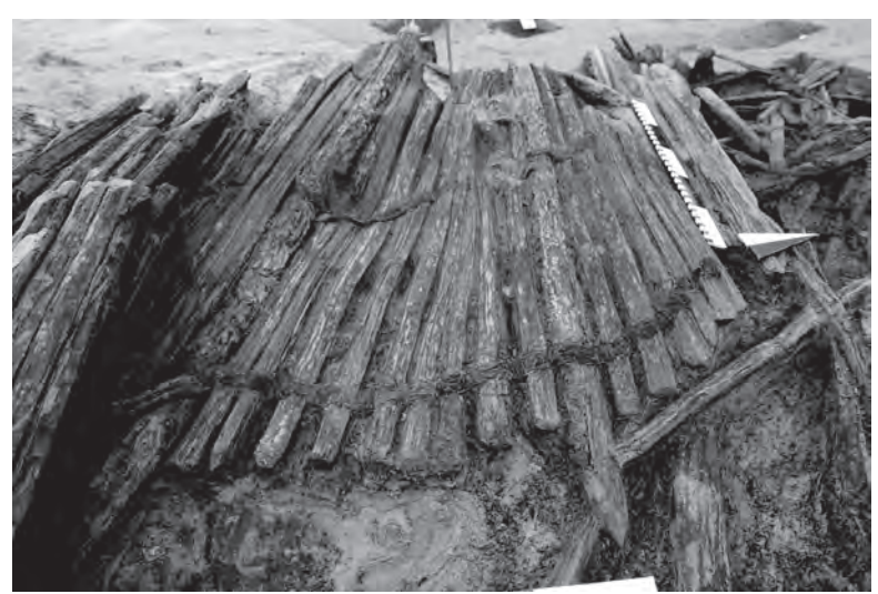
Figure 9. Okhta 1. Fish screen, detail with binding, Neolithic layer. After Bazarova et al. 2010: 169 Fig. 4.

pattern can be traced not only at Zamostje 2 but at many sites, it probably reflects some palaeoecological peculiarities or could be explained by a different fishing strategy. However, it should be noted that the standardised production of splinters for fish screens or fish traps is accounted for especially in the periods of the Late Mesolithic and Early Neolithic.