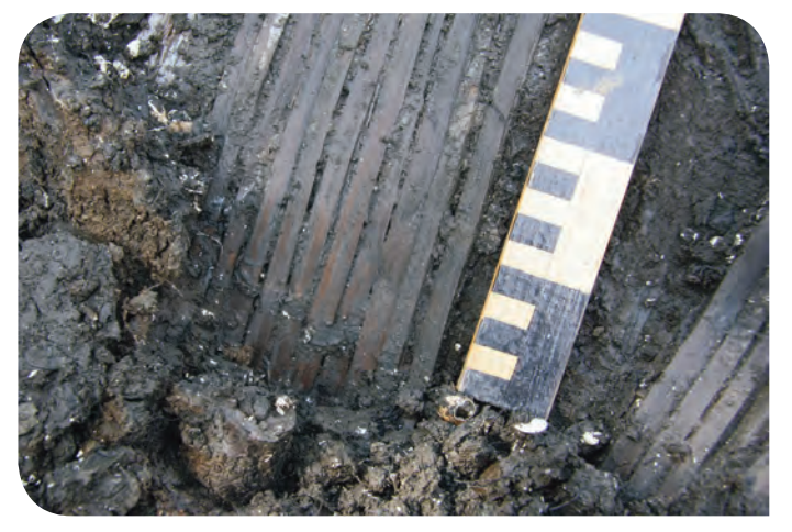
Figure 4. Zamostje 2. Detail of a fish trap with a part of binding, Early Neolithic layer.