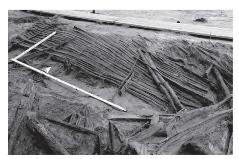
Figure 8. Okhta 1. Fish screen in the Neolithic layer. After Bazarova et al. 2010: 169 Fig. 5.