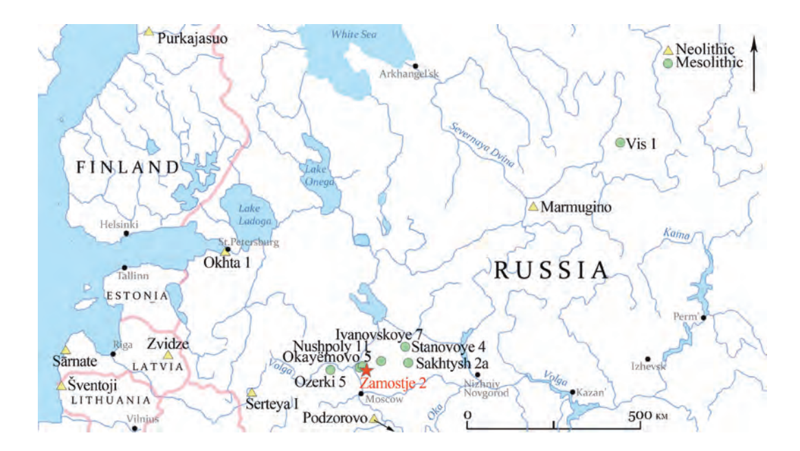
Figure 1. Location of Mesolithic and Neolithic settlements mentioned in the article. Drawing: F. Myachin, modified by O. Lozovskaya.

Fish fences. By the term fish fence, we mean a long-term structure consisting of one, two, or more rows of massive wooden piles (diameter from 5 to 15 cm), vertically hammered into the river or lake bottom. The space between piles is normally filled with wood branches or