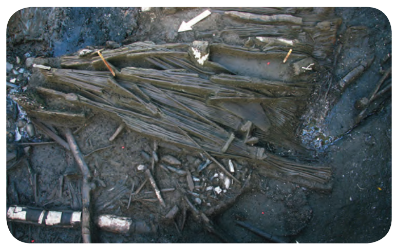
Figure 3. Zamostje 2. Fish trap with a paddle in the Early Neolithic layer, seen from the west.